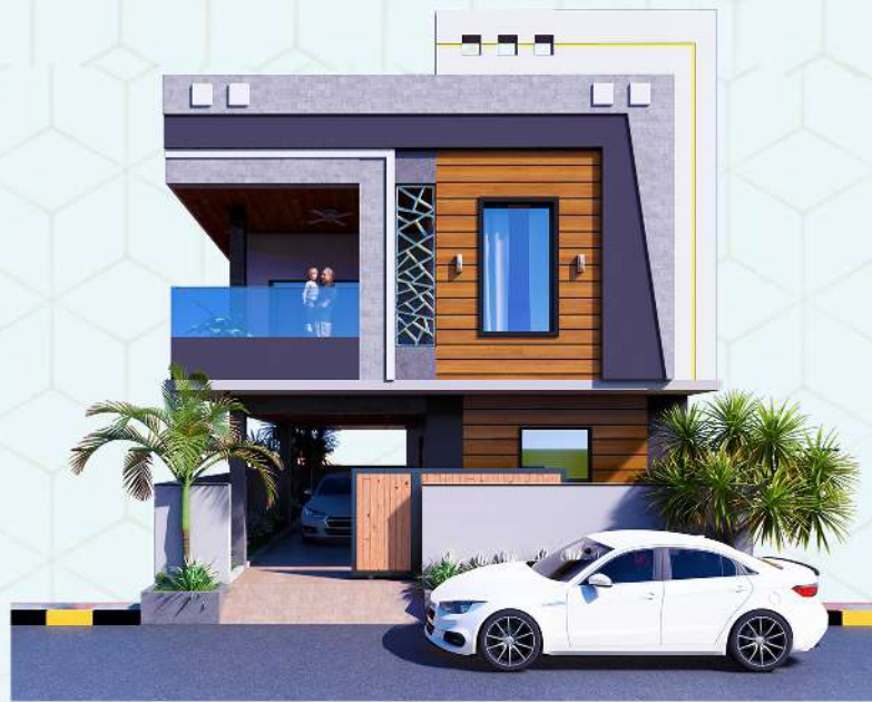
DUPLEX MODEL HOUSE