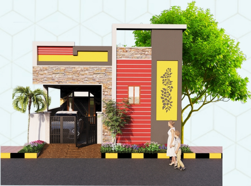
INDEPENDENT MODEL HOUSE