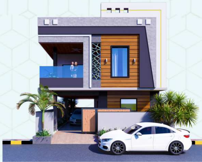
DUPLEX MODEL HOUSE