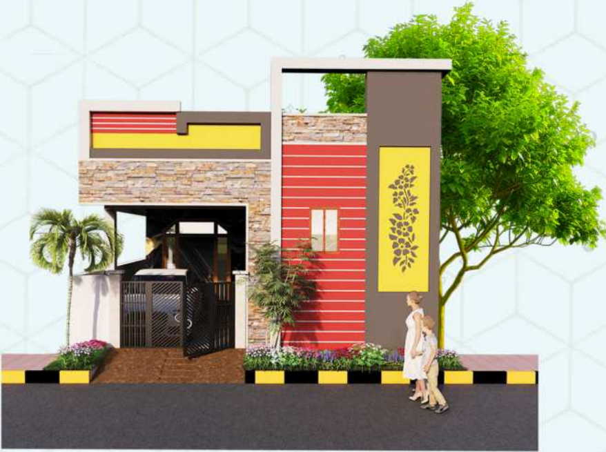
INDEPENDENT MODEL HOUSE