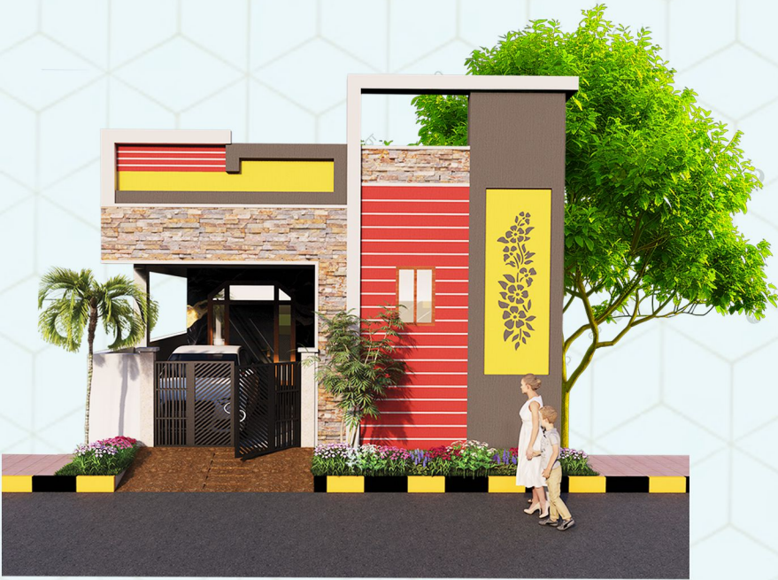
INDEPENDENT MODEL HOUSE