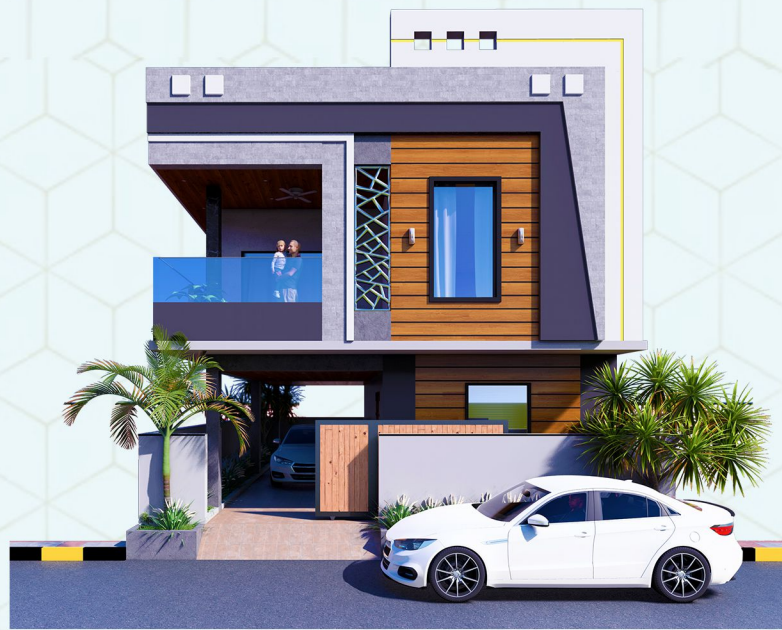
DUPLEX MODEL HOUSE